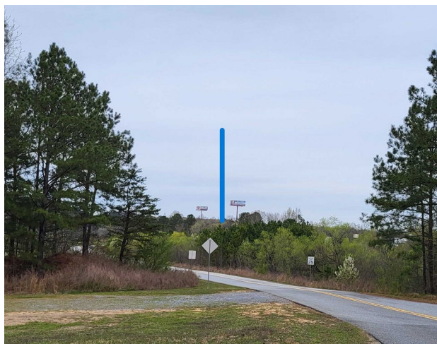
Blue line indicates where tower will appear from Historic Site entrance road.