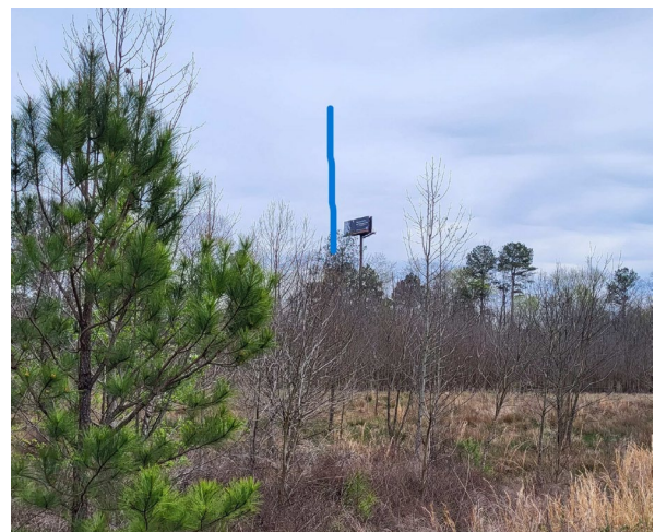
Blue line indicates where tower will appear from Site interpretive kiosk #2.

Georgia Battlefields Association PO Box 669953 Marietta GA 30066