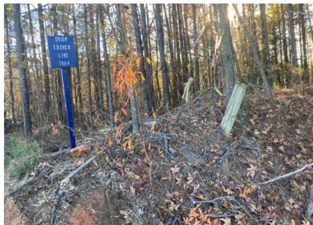
U.S. trench north of Lovejoy's Station.