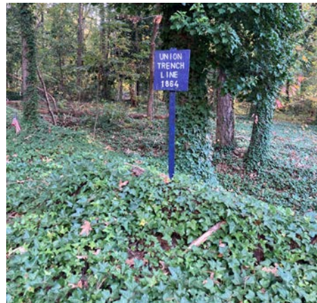
U.S. trench in East Point.