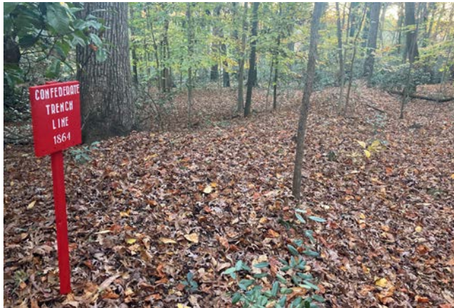
C.S. trench in John A. White Park