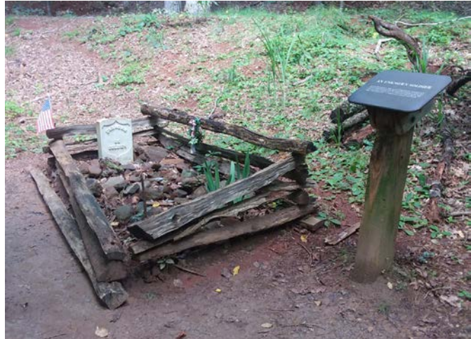
Left: Fire was set at the base of the monument and discolored the stone under the figure at left. Right: The small flag (left side of photo) at the grave is an example of those that were burned.

Defacing or destroying a monument in a national park is a federal crime, regardless of motive. If you have information about this crime, report it by calling or texting 888-653-0009, using the online form at https://www.nps.gov/orgs/1563/submit-a-tip.htm , or e-mailing nps_isb@nps.gov .