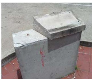
Left: Broken concrete base.

An additional act of vandalism occurred near the site of Whitehall Tavern in southwest Atlanta. A plaque was stolen from its concrete base, and the base was broken. The plaque was at the northeast corner of the Lee Street and Ralph David Abernathy Boulevard intersection.