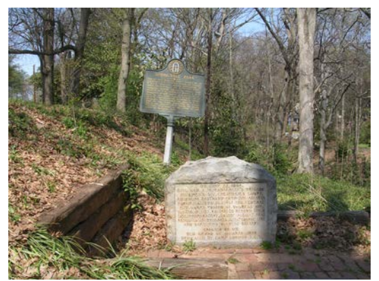
Monument where Manigault's Brigade reformed during 22 July 1864 Battle of Atlanta. The marker behind the monument would not be included