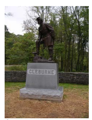
Cleburne monument in Ringgold Gap pavilion on 27 November 1863 battlefield.

American Battlefield Trust announced that it is compiling an inventory of battle-related monuments that are NOT on National Park Service sites. In response, Georgia Battlefields Association forwarded photos and locations of monuments in Georgia that met the criteria. Here are some examples.