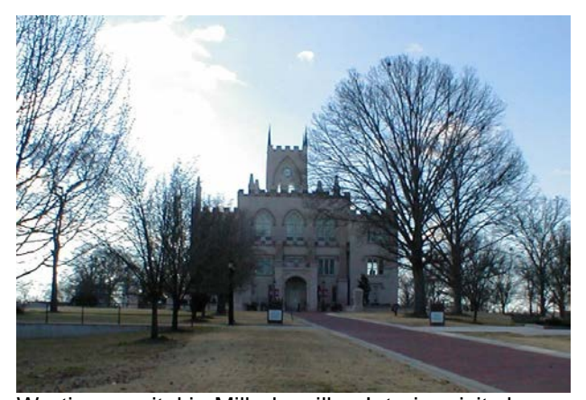
Wartime capitol in Milledgeville. Interior visits have been suspended due to virus restrictions. We believe the building will be open by October.

Cost is $430 per person. Your reservation is confirmed when payment is made, either by sending a check to Georgia Battlefields Association at PO Box 669953, Marietta GA 30066, or by paying online through www.georgiabattlefields.org.