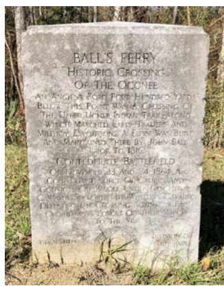
Monument at site of late November 1864 actions at Ball's Ferry.