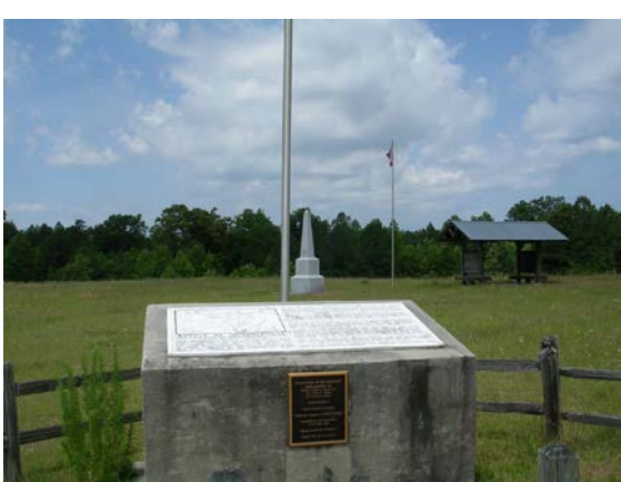
Griswoldville Battlefield Park, which was acquired using funds raised by GBA, then deeded to Georgia State Parks..