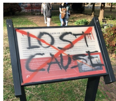
Contextual sign.