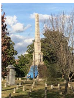
Obelisk with tarp around base.

Georgia Battlefields Association's position remains unchanged. While we have advocated for battlefield monuments to be in a special category, damage to public property is a crime whether or not it occurs on a battlefield, and criminals should be pursued and prosecuted. Damage to cemeteries is egregious.