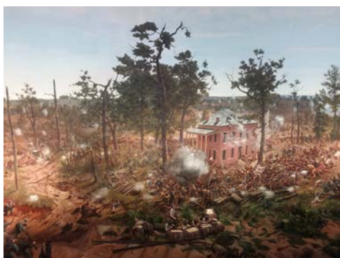
Cyclorama section looking northwest. In left & right foreground, U.S. 15 th Corps troops counterattack Manigault's Brigade deployed around the Troup Hurt House. Captured guns from DeGress's battery are to the right of the house.