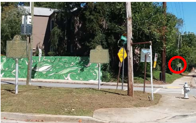
Today: Railroad Cut (left) and Pope House (center) markers with posts set in deeper holes. 15 th Corps Sector marker (circled in red) partially obscured by foliage on right along DeKalb Avenue.