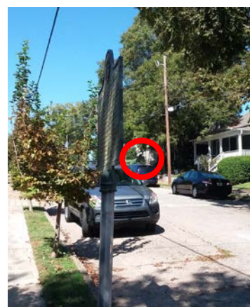
Manigault's Brigade marker edge-on in foreground. Troup Hurt House marker (circled in red) in distance.