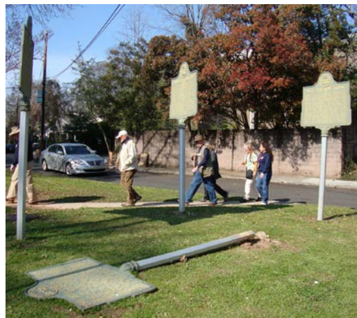
March 2018: Four markers collocated, but 15 th Corps Sector marker has toppled.

Georgia Battlefields Association PO Box 669953 Marietta GA 30066