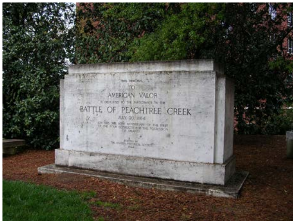
Monument front in 2008.

In correspondence with the management of the Atlanta Historical Society, now doing business as the Atlanta History Center, GBA was informed that reinstalling the monument anywhere at this time would likely invite defacement, damage, or destruction. Consequently, Georgia Battlefields Association is working with Atlanta History Center and Piedmont Hospital to securely store—or quarantine, to use a pandemically appropriate verb—the monument's disassembled pieces.