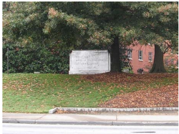
Former location: Peachtree Road in foreground; hospital in background.