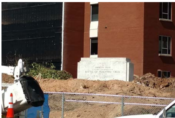
Construction underway in early 2017 before monument's disassembly.