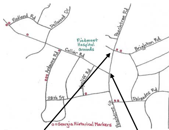
Former monument site. Proposed new marker site.

Since the monument will not be reinstated to mark the battlefield, Georgia Battlefields Association believes a historical marker would be appropriate on the east side of the Peachtree Road and Collier Road intersection to indicate that the 20 July 1864 battle began near that point when troops of Walker's Confederate division first struck the line of Newton's Federal division (see smaller scale map on left). A dozen Georgia Historical markers from the 1950s are in the area (see larger scale map on right), but none is as visible as would be one on Peachtree Road. Realistically, any new Civil War marker, regardless of how accurate, would likely invite protest and damage at this time; but GBA remains committed to marking the site eventually.