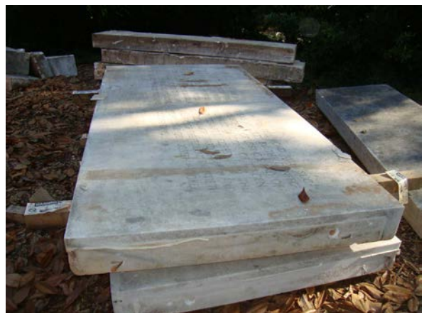
Disassembled monument later in 2017.