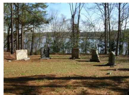
Allatoona Pass monuments