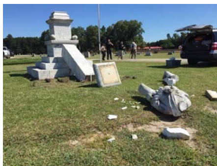
August 2018 damage in Screven Memorial Cemetery

Through efforts of the Sons of Confederate Veterans and the United Daughters of the Confederacy, the monument was repaired and rededicated on 26 October 2019.