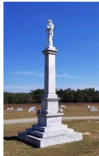
October 2019 restoration