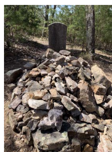
Grave before vandalism

Vandalizing a grave is a crime and is not justified under any circumstances.