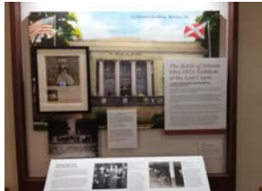
Lower Gallery display.