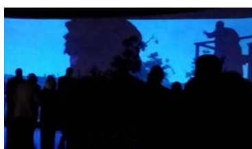
Projection onto the painting.