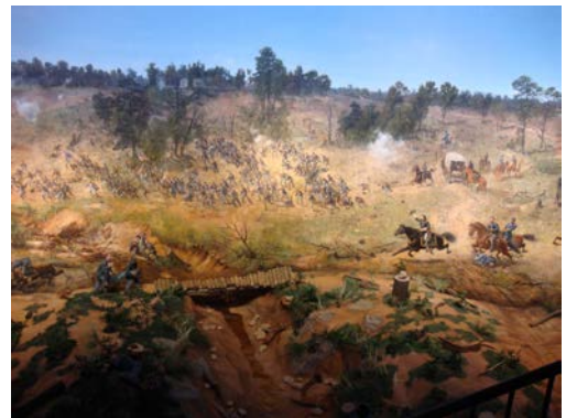
A much brighter painting and diorama. Georgia Battlefields Association urges you to visit the restored painting and the new displays. Let the Atlanta History Center know your reaction.