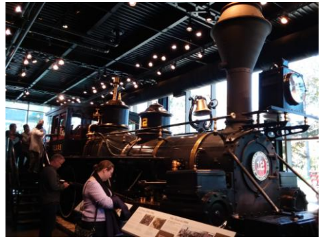
New waist-level display