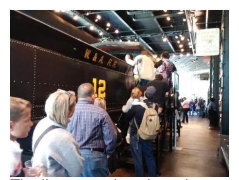
The line to get into the cab

While the locomotive and milepost are premier attractions, the exhibit addresses more broadly the importance of railroads to the existence and growth of Atlanta. The Atlanta History Center has significantly enhanced its ability to present the city's story.