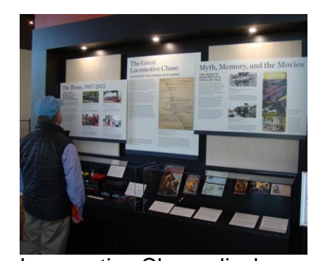
Locomotive Chase display