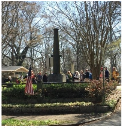
At the McPherson monument in East Atlanta.