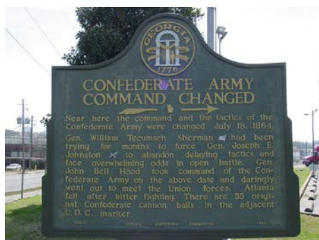
Command marker in better days.

GBA looks forward to working with GHS to reinstall the markers at the correct location.