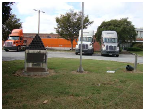
Cannonball pyramid with broken post for Command marker at right.