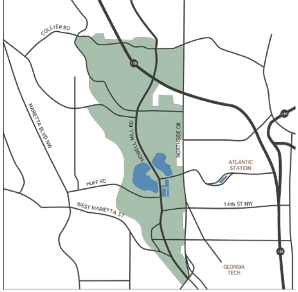
Map of Upper Westside Improvement District in Northwest Atlanta.

The Upper Westside Improvement District www.upperwestsideatl.org was created in 2016 by commercial property owners in northwest Atlanta with the objective of enhancing transportation, connectivity, and safety for the area through investment and community partnerships. The spine of the district is Howell Mill Road (see map). GBA was contacted by district representatives who are writing a history of the area as a foundation of the planning process. They were already aware that the area had a Civil War connection and asked GBA for more details, which we were glad to provide. The Confederate exterior line of 10-21 July 1864 passed through the area, and it was from this line that part of Stewart's Corps advanced during the 20 July Battle of Peachtree Creek. General Hood was at Stewart's HQ at the Foster residence