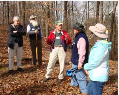
Discussions often lead to better understanding for participants and the guide.