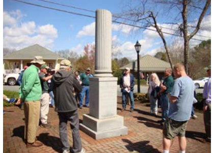
At the monument to Roswell men who served the Confederacy and Roswell women mill workers.