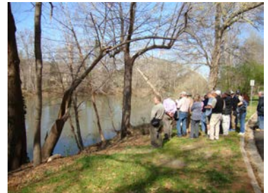
At the fish dam where the Federals first crossed the Chattahoochee River.