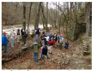
At Sope Creek paper mill ruins.