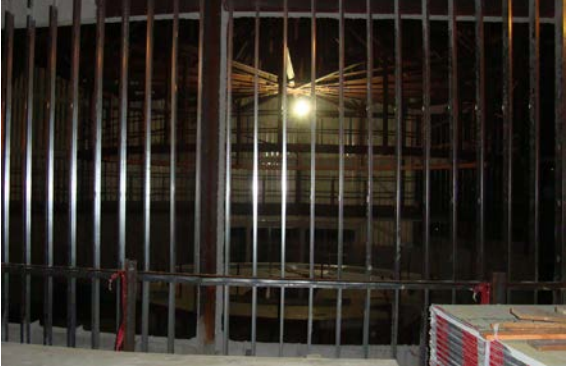
The viewing platform is visible towards the bottom of this nighttime photo through the outer wall framework.

Georgia Battlefields Association P.O. Box 589 Tate GA 30177- 0589