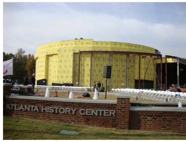
Looking south from West Paces Ferry Road on Veterans Day. The overhang to the right will be the hallway in which Texas is displayed so it will be visible from the road and lighted at night.

Locomotive Texas remains in North Carolina undergoing conservation. Related web sites are: <a href="https://www.nctrans.org/Events/The-Texas-Locomotive.aspx">www.nctrans.org/Events/The-Texas-Locomotive.aspx</a> www.atlantahistorycenter.com/explore/coming-soon-atlanta-cyclorama.