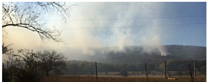
30 October: Fire on east slope of ridge.