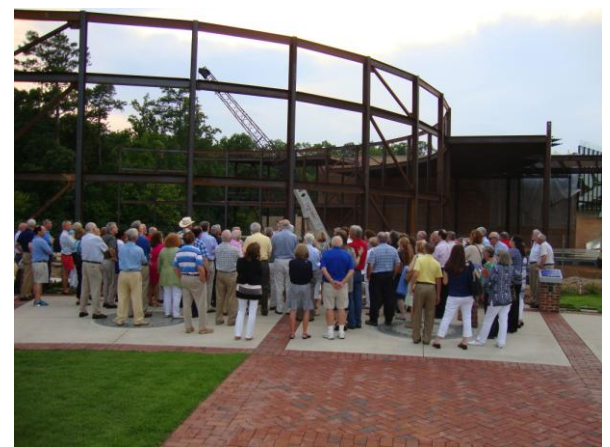
Civil War Round Table members gather at the framework of the new building.

The Texas is being restored at the North Carolina Transportation Museum in Spencer (adjacent to Salisbury: I-85 exit 79). The engine has not had such a thorough dismantling and restoration for over 100 years. Most of its components were discovered to be post-Civil War. Museum visitors can see the restoration process. <u>www.nctrans.org/Events/The-Texas-Locomotive.aspx</u>.