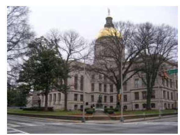
Two photos taken from the same spot 150 years apart. On the left, Atlanta City Hall in 1864, torn down 1868 to allow construction of the Capitol, shown above. We'll see this spot during the downtown walking tour.