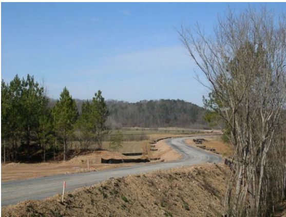
Photo looking north from future park entrance along access road.

Dotted outline indicates 505 acre state park.