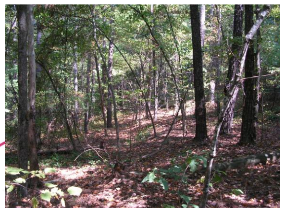
Possible trench on City of Dallas property