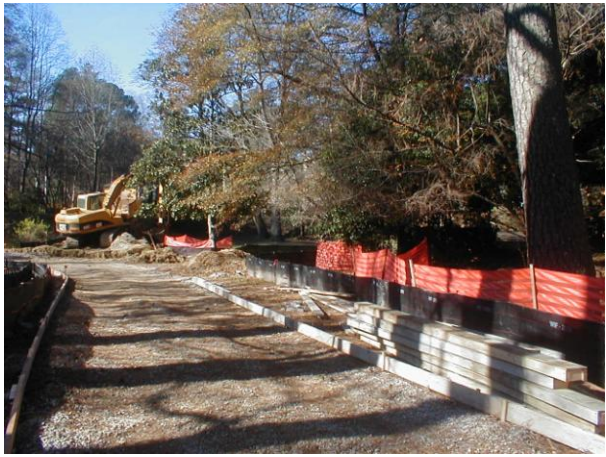
Construction near the Collier Road bridge over Tanyard Creek. One of the existing Battle of Peachtree Creek plaques is in the background, just to the left of the tree.

The bike path through the Peachtree Creek battlefield is under construction. GBA supported the effort of the local neighborhood associations to reroute the bike path from the largest open space in Tanyard Creek Park, and we were partially successful (May 2008 newsletter).