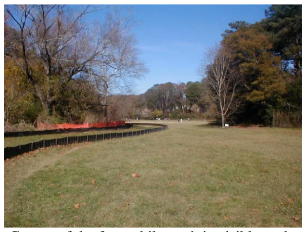
Course of the future bike path is visible to the left, shortly before it turns westward to cross Tanyard Creek, leaving most of the meadow as open space.