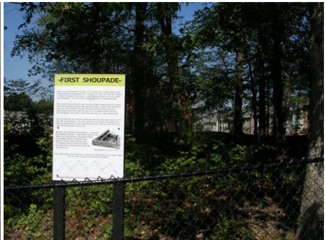
Marker behind the first Shoupade (#2 on map) along the walking trail.