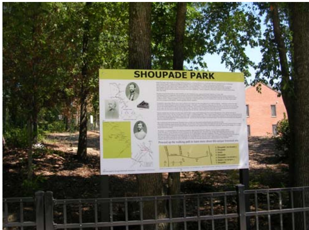
An overall marker for the park is just east of the parking pull-off along Oakdale Road.