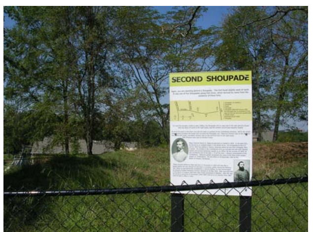
Marker immediately behind the second Shoupade (#4 on map) included in the park.