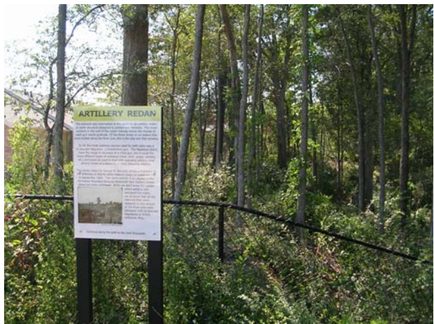
Marker on the east edge of the only remaining artillery redan (#3 on map).