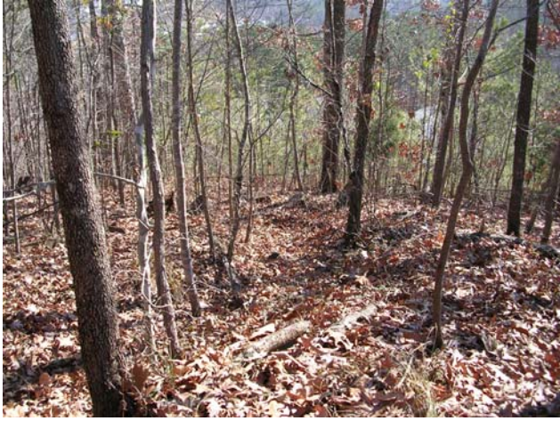
Trench on the hill east of the Dallas Post Office. Dug by Confederates on and after 27 May 1864. Through the trees are houses on Hampton Drive.