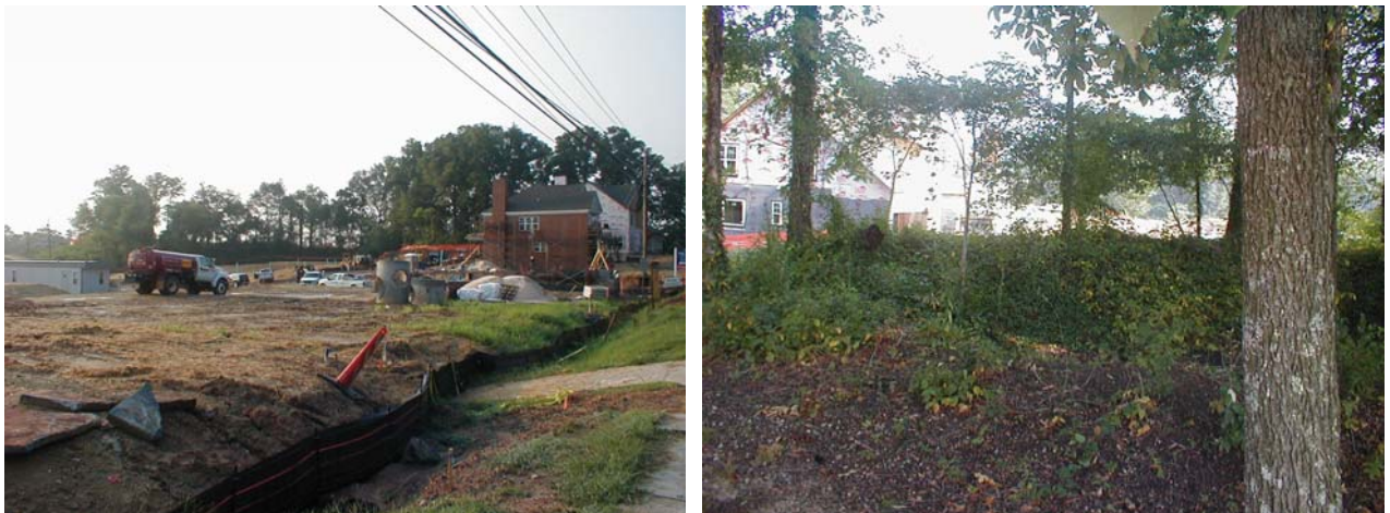
Photo on left looks southeast from the sidewalk along Oakdale Road. The site has been extensively graded, and construction is underway. The tree line in the distance contains Shoupades 2 and 4 and redan 3. Shoupade 2 is behind the houses being built at the right (west) edge of the photo. Shoupade 4 is in the trees near the left edge of the photo, with redan 3 and the palisade between the Shoupades. Photo on right looks north from behind Shoupade 2 and suggests the view that will result when construction is complete.

The photos below show Fort Drive's status as of early August 2006.